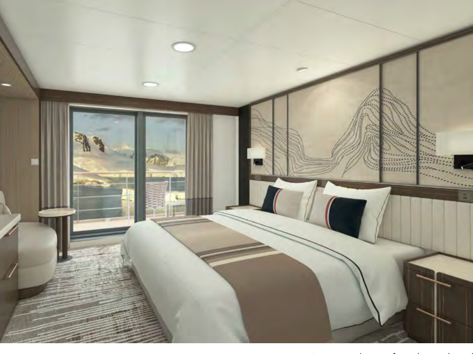
↑ Artist's rendering of a cabin on board Magellan Discoverer