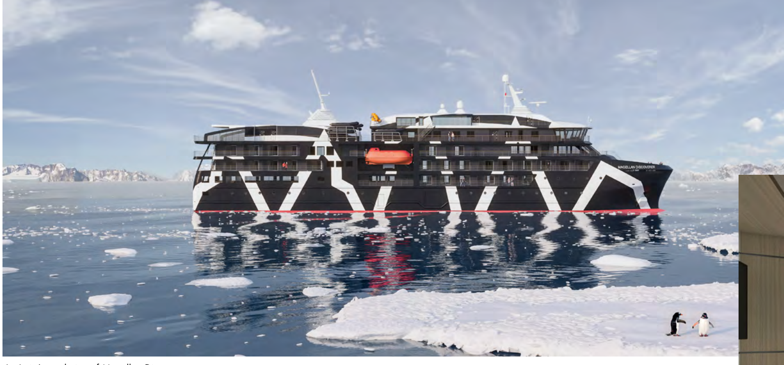
↑ Artist's rendering of Magellan Discoverer