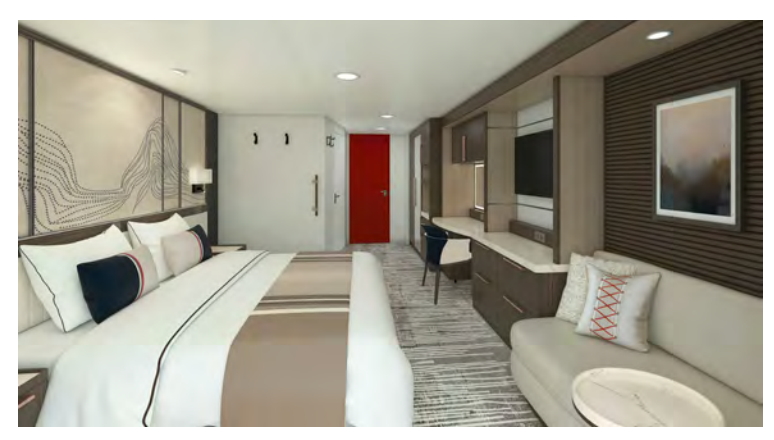
↑ Artist's rendering of a cabin on board Magellan Discoverer