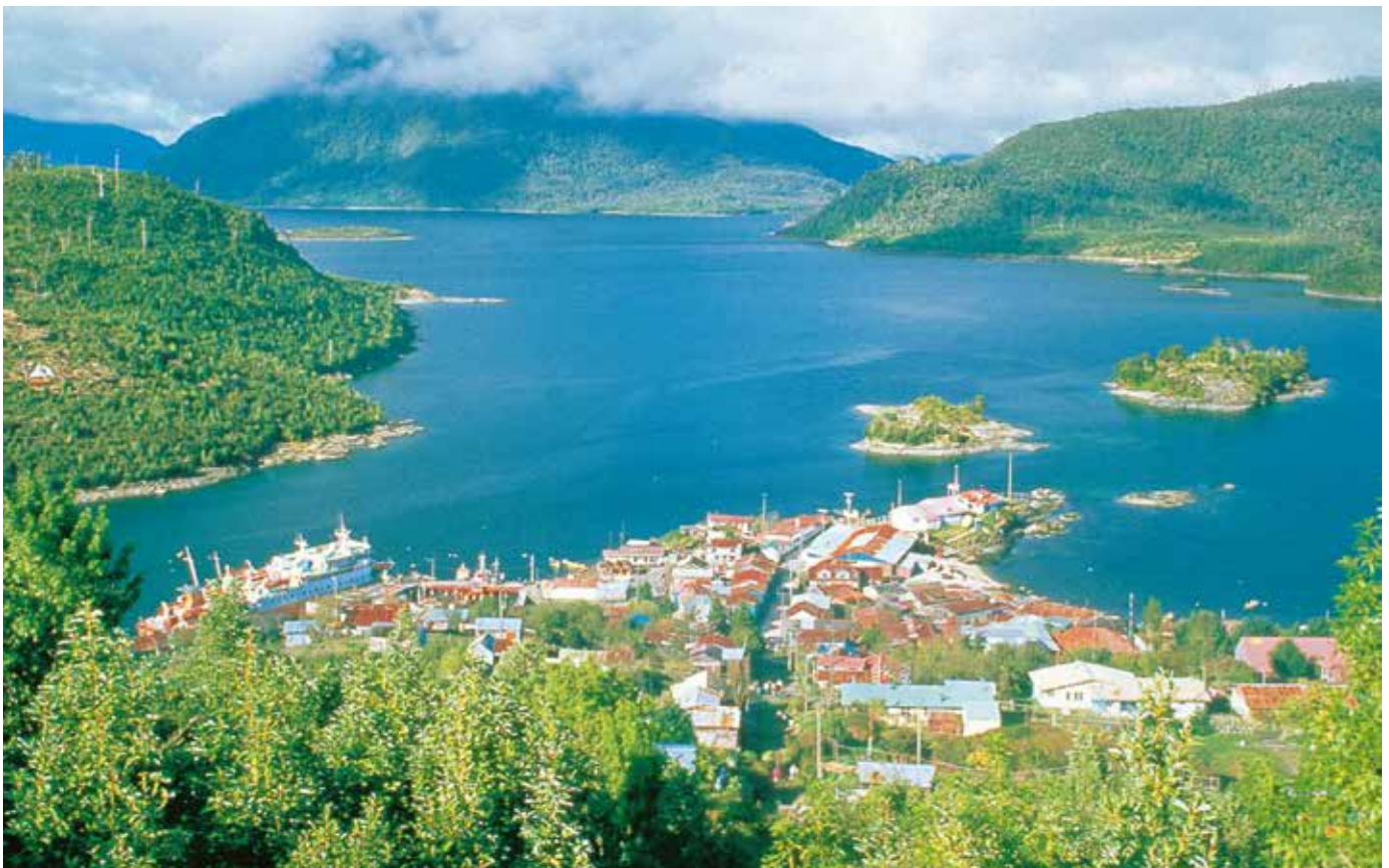
Puerto Montt, Calbuco cities and view of Puerto Aguirre.