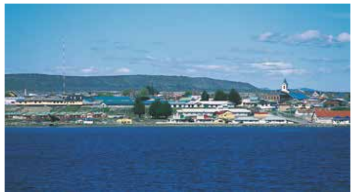
El Brujo Glacier, elephant's seals in Guadramiro Bay and Puerto Natales city.