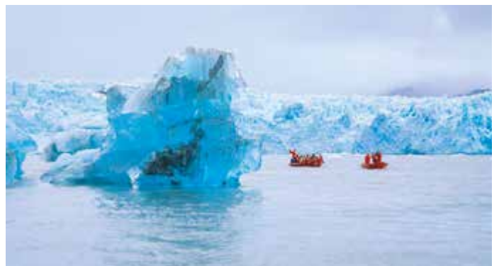
Pío XI Glacier