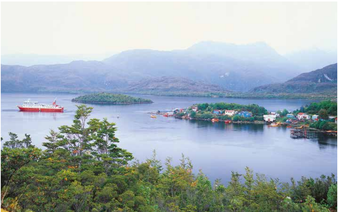
Bernardo Glacier and Puerto Edén.