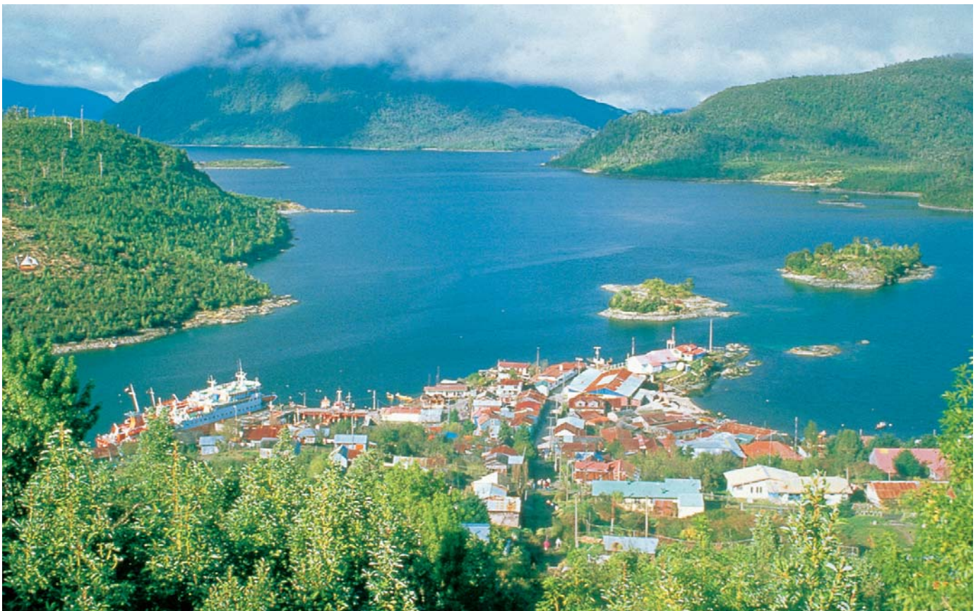
Puerto Montt, Calbuco cities and view of Puerto Aguirre.